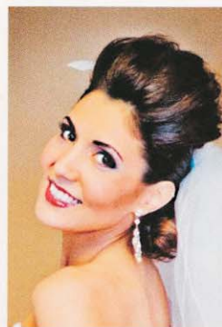
Sweet and Sexy Smoky Eyes makeup