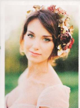
All Natural Bare-faced makeup

To look your best, you should prepare ahead and avoid common makeup mishaps. A bride should look like herself - at her most beautiful, yet her makeup should be extraordinary on this special occasion.