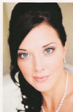
Bright Eyes makeup